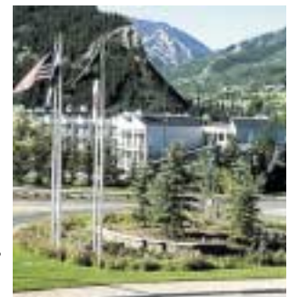
Website front page greets you with a beautiful and familiar scene

Some browsers are reportedly not showing the data encryption "lock" but let us assure you that your information is secured behind two firewalls: at the web host company and within our reservations/payment system. In addition, all major credit cards offer online fraud protection so you may access your account with peace of mind.